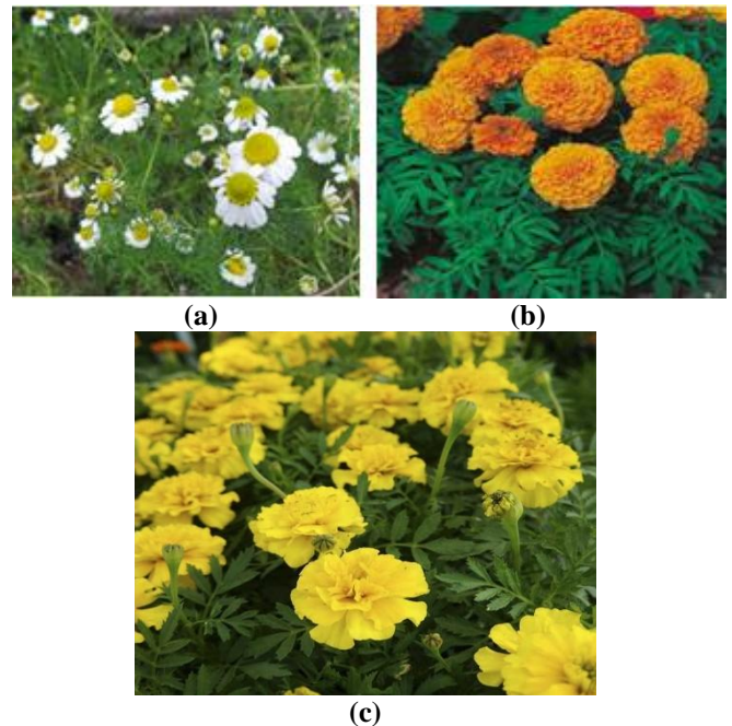
Figure 1: (a) Matricaria chamomilla (b) Calendula officinalis (C) Calendula officinalis